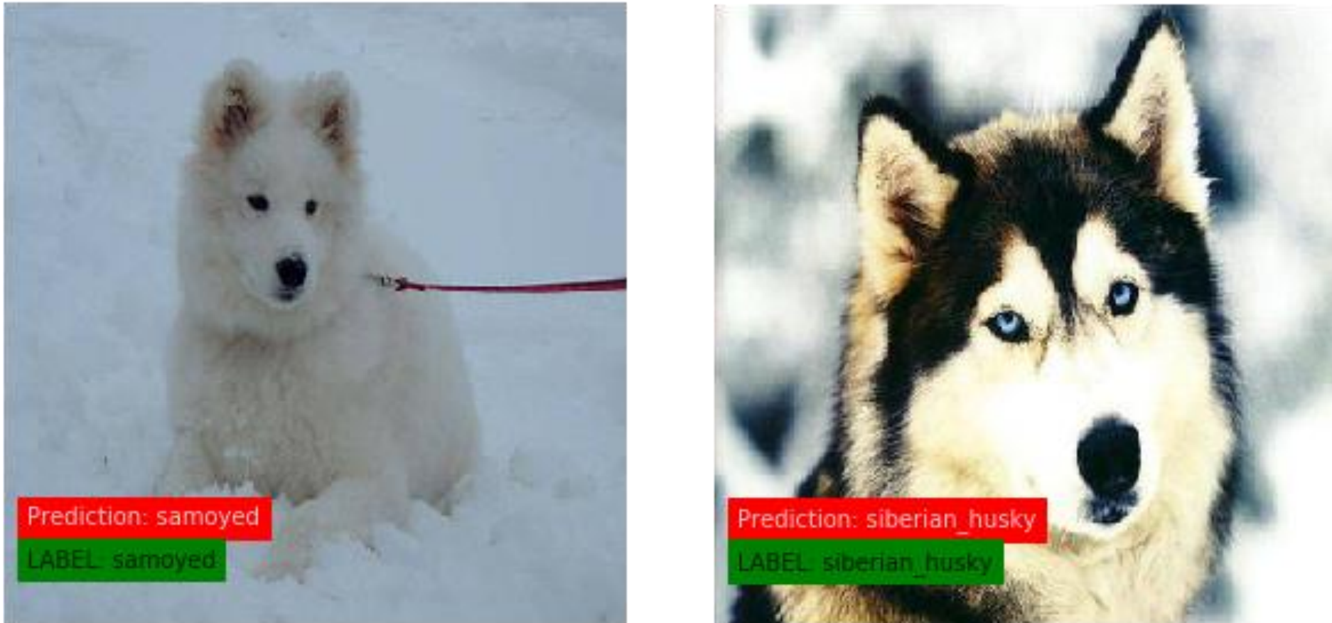
Figure 2. Examples of correct prediction by our model.

We select top 40 categories of dogs with highest frequency in the dataset. There are 4029 training and test set and we get 0.03% training error and 18.59% test error by our model.